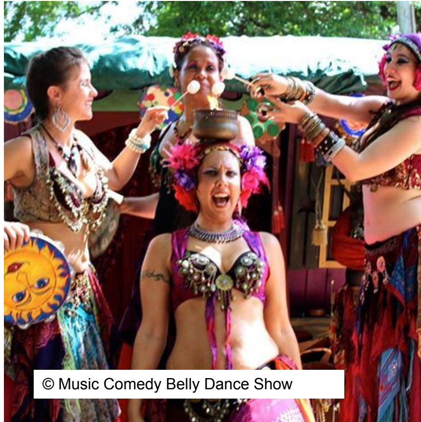
© Music Comedy Belly Dance Show